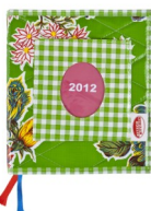
Choice 1: Green

The cover of the agenda is changeable and is available in different Kitsch Kitchen prints.