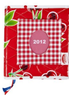
Choice 3: Cherry