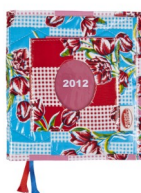
Choice 2: Tullip