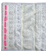
Choice 5: grey dot

Special edition: Cover lace (deliverable from the end of September)