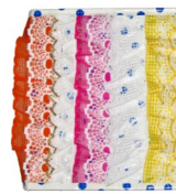
Choice 8: blue dot