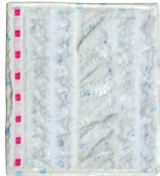
Choice 6: blue dot