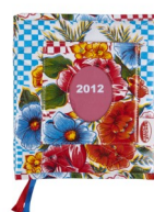
Choice 4: Flower

Special edition: Cover lace (deliverable from the end of September)